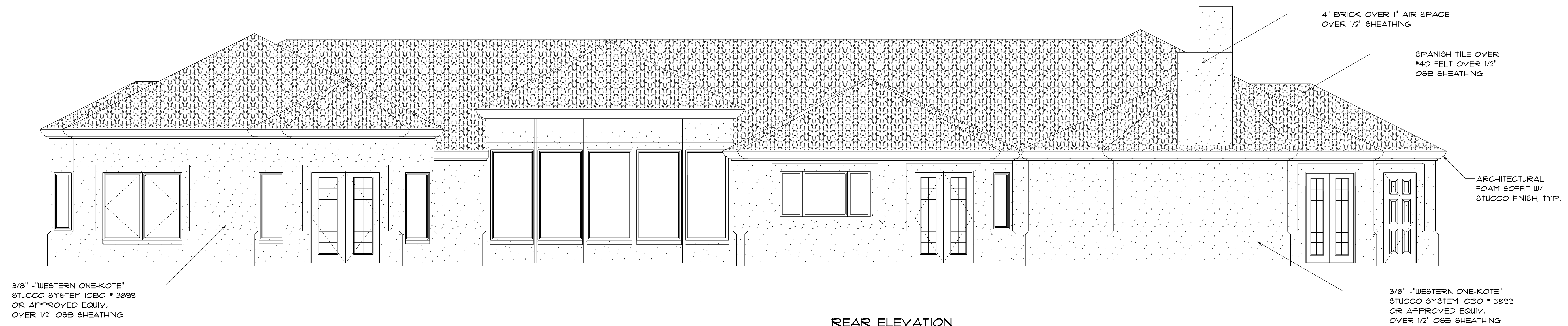
REAR ELEVATION 1/4"=1'-0"

NOTE: FIELD VERIFY ALL DIMENSIONS PRIOR TO COMMENCEMENT OF CONSTRUCTION.